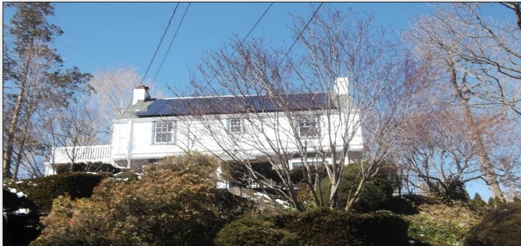
My House on the Hilltop in Bronxville

It was a great honour for me to represent World Federation of Methodist and Uniting Church Women (WFMUCW) at the United Nations Commission of the Status of Women (CSW) 57 and 58 Meetings of March 2013 and 2014 respectively.