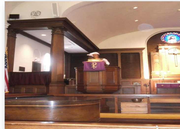
Advocacy and information sharing on GBV to Adults at Ashbury Methodist Church