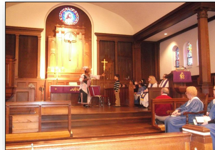
Children's Message – Violence Against Girls