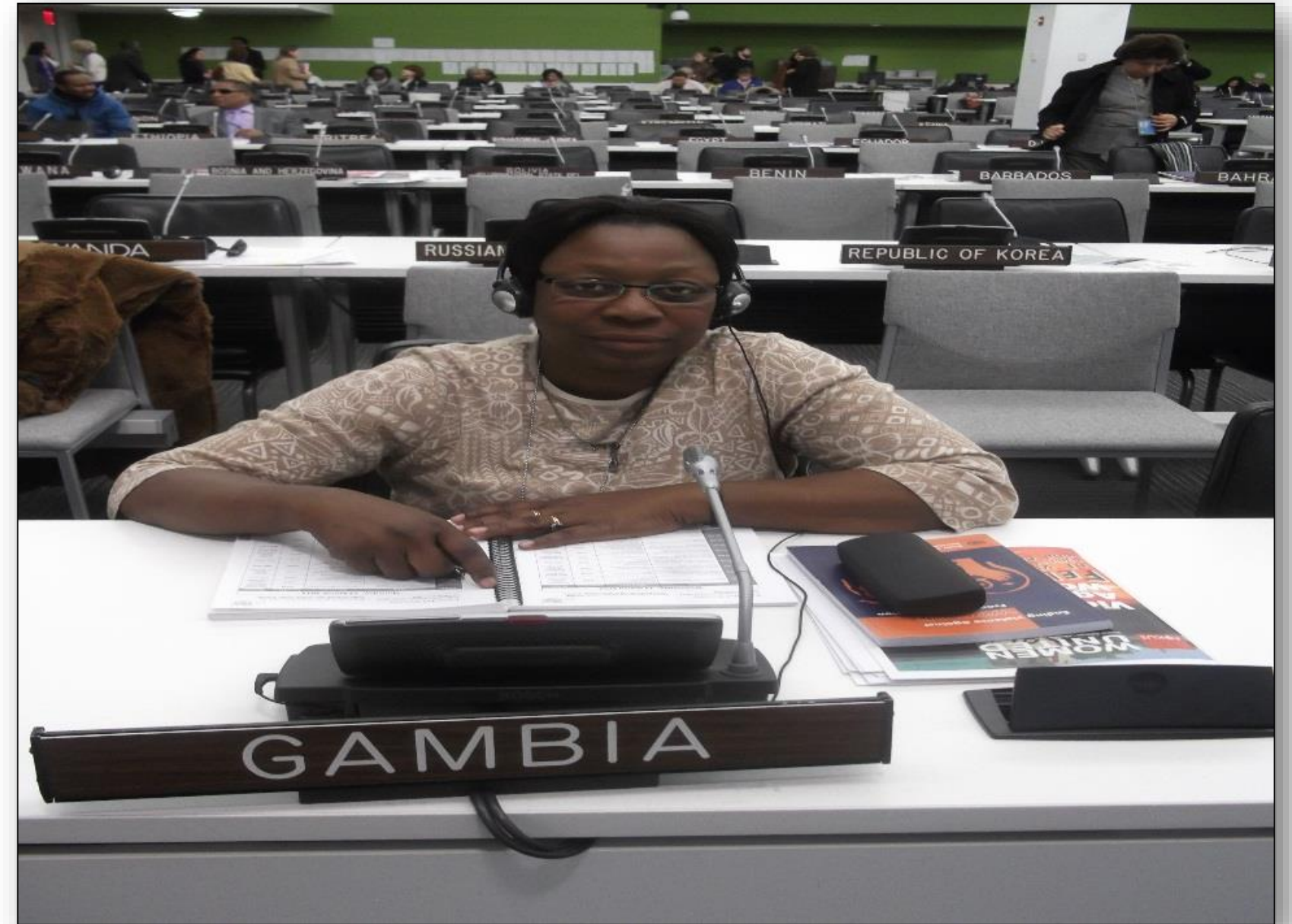
Conference in Session

It was evident that there had been lapses in the efforts of CSOs (including Faith based organisations), to adequately advocate, campaign and lobby for the existing laws to be enforced; and governments to either domesticate the international treaties they have signed or implement them. The non-the involvement of 'men' (who are mostly the perpetrators) was very evident.