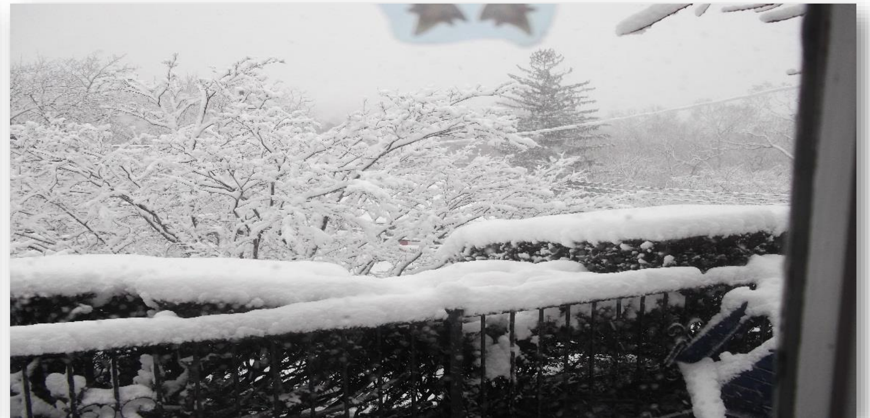
Snowing in New York